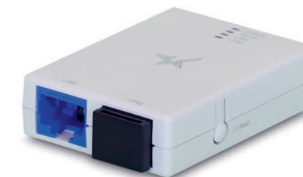
MCW10 Wireless LAN Module

The new TSP100IV from Star brings a unique new design for a truly revolutionary product. The quality and reliability of the popular TSP100 series has been fused with enhanced connectivity and specialist printing features for the very latest in point of sale and omni-channel commerce. For the ever-changing retail environment, the TSP100IV has every angle covered!