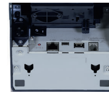
TSP100IV Multi-Connectivity Interfaces